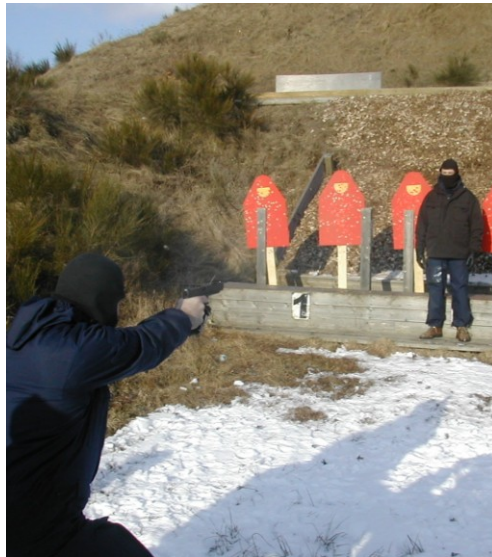
Realistic Firearms Training is crucial to ensure that any use of force is based upon "Precision".

➤ For immediate assistance call: +354 618 4626